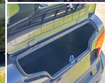
LOCKABLE BOOT COMPARTMENT