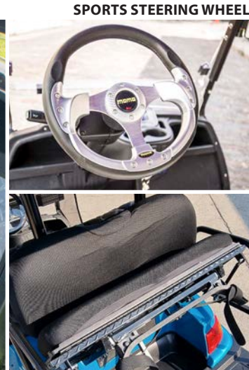
3-WAY REAR SEAT FEATURE